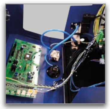
Easy access to all electronic components