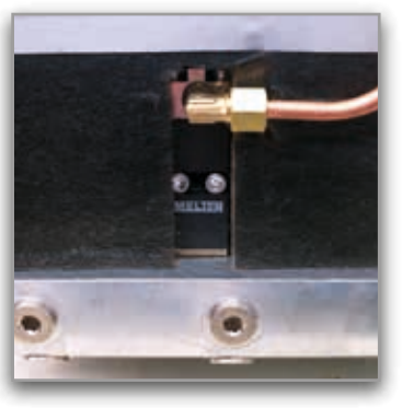
Pressure discharger valve for safe maintenance and servicing