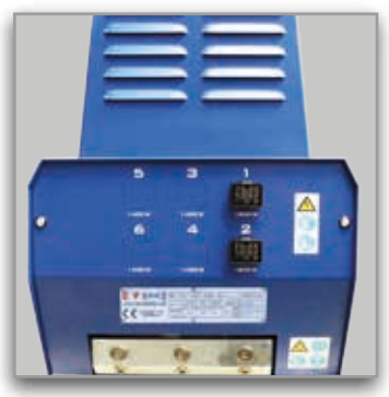
Up to six compatible channels for hose / gun connections