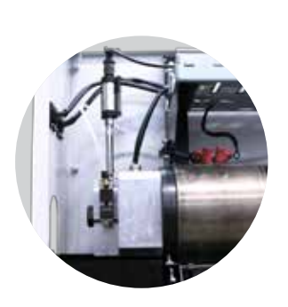
Output pressure transducers activate the discharge module to avoid overpressure on the system