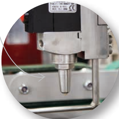
EZT LN extended nozzle for space restricted areas